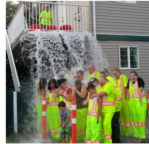
August 2014 Ice Bucket Challenge in support of Amyotrophic Lateral Sclerosis (ALS) or Lou Gehrig's Disease.