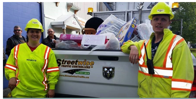
Since 2014 our team has volunteered our time to conduct the traffic control for the Annual Fraser Valley Toy Run.